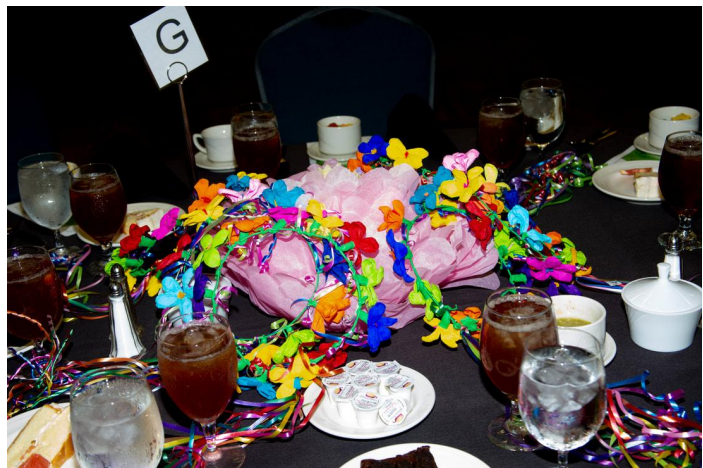
Birthday Brunch table decorations.