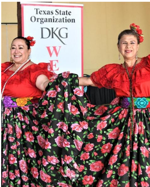
50+ women's folkloric group that entertained before the Saturday Birthday Brunch