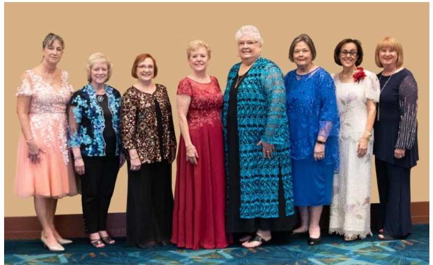
Incoming 2023-2025 TSO Executive Board.